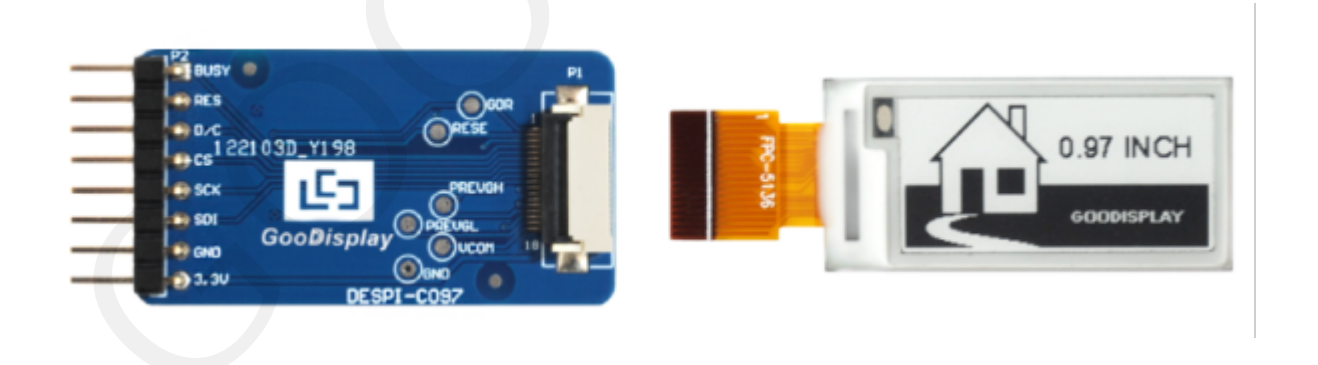
Figure 2: Connection of E-paper display and Adapter

Note: This connector is a rear lock type. When using it, you need to stand up the switch first, insert the E-paper display and then press the switch to lock it.